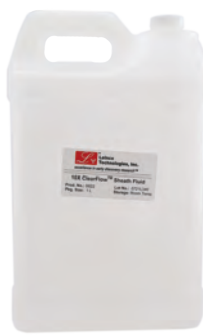
S622, 2x 1L