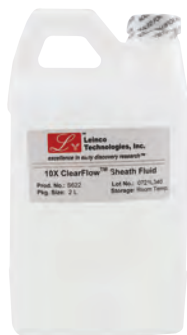
S622, 4x 2L