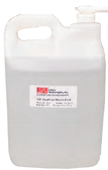
S622, 2x 10L