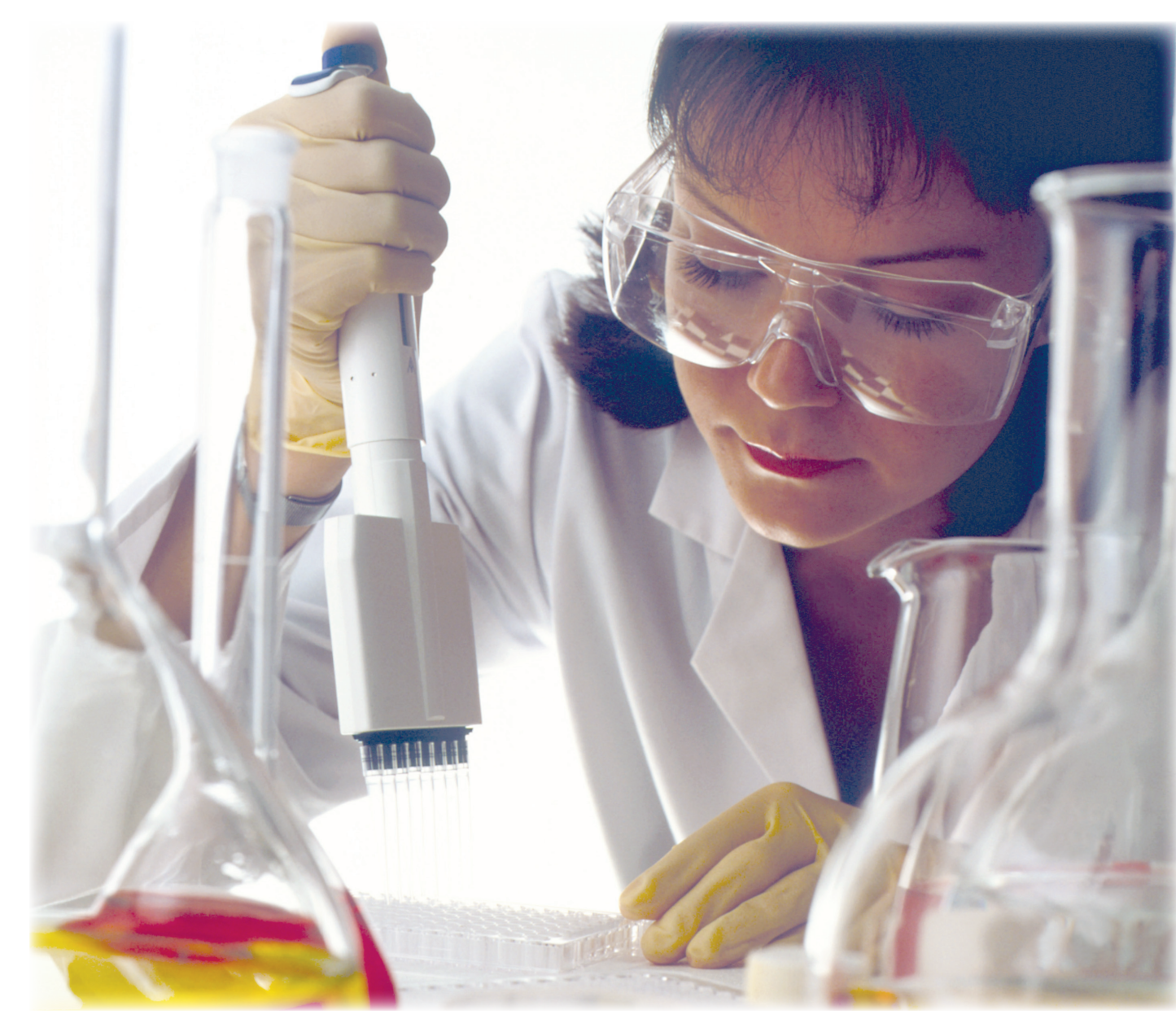
ELISA Development Kits "Ready To Use"